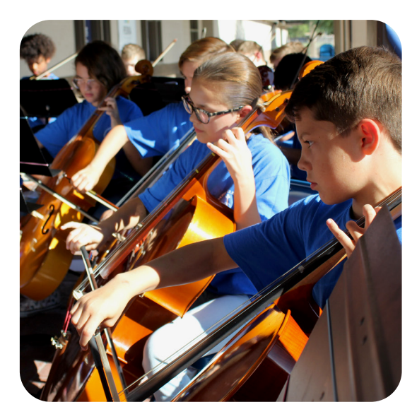
You don't have to have a student in school to donate.